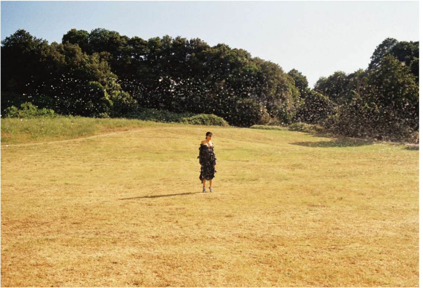
Dress Naomi Tarazi, necklace Dea Rail, Shoes Damiano Marini